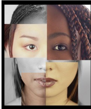
http://www.understandingourbarn.com A Project ko an National Anthropological Association