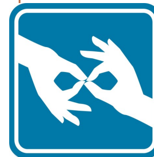
Interpreters Available or Please request a Sign Language Interpreter

Social Service Agencies, Charitable Organizations, or Churches may be able to help you with the expense. Call 211 for a list of agencies in your area.