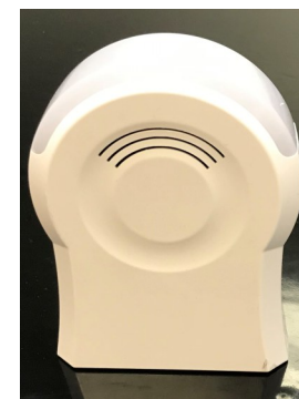
Flashing Audio doorbell

NOTE: As in most tenancies, any damages caused by the tenant or their guests/animals beyond normal wear and tear, may be charged to the tenant during tenancy or at move out.